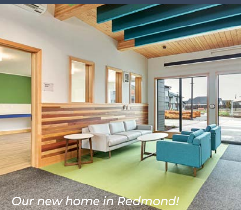
Our new home in Redmond!